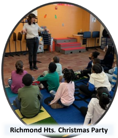
Richmond Hts. Christmas Party

Christmas Parties “kicked off” two of our after-school Good News Clubs. Twenty-five children enjoyed the fun and songs and were super attentive for the teaching. Most were new to Good News Club ®. God is expanding the influence of clubs by bringing new children.